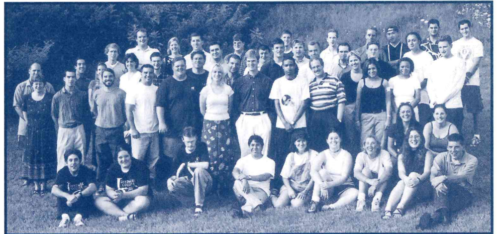
Reunion group photo. See Page 4 for more Reunion photos.