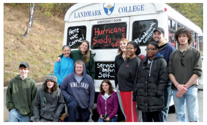
In the aftermath of Superstorm Sandy, Landmark students and staff headed to New York to assist with clean-up efforts.

One of LCOGs most ambitious projects occurred on November 16, 2012 as nine brave students and two Landmark staff members traveled to Rockaway, N.Y., in wake of Hurricane Sandy. They partnered with Team Rubicon (a group of former military personnel/veterans, and military personnel who are home from their tour overseas). In two days, the team demolished six homes, rebuilt three storage sheds, donated 17 bags of clothing, donated four bags of blankets, donated five pounds of food, saved a woman from being evicted, cared for five children, cleaned 24 cats and their homes, fed six families, and donated three cases of water and nine cases of soda. The team gave residents hope and listened to their cries... but most importantly, they became family.